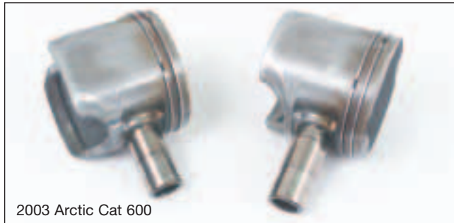
2003 Arctic Cat 600

No carbon deposits are detectable in the functioning region of the exhaust power valves, resulting in "no stick" performance and continuous valve operation during the field trial. Note: Excess oil was removed with solvent to reveal the true condition of the valves.