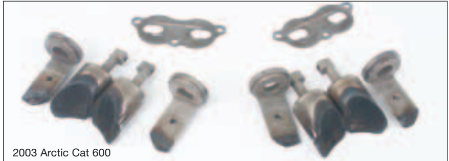
2003 Arctic Cat 600

Subjected to adverse field testing conditions in the Rocky Mountains, including long trail rides, high RPM powder riding and steep hill climbs, AMSOIL INTERCEPTOR™ demonstrated superior wear protection and outstanding deposit control.